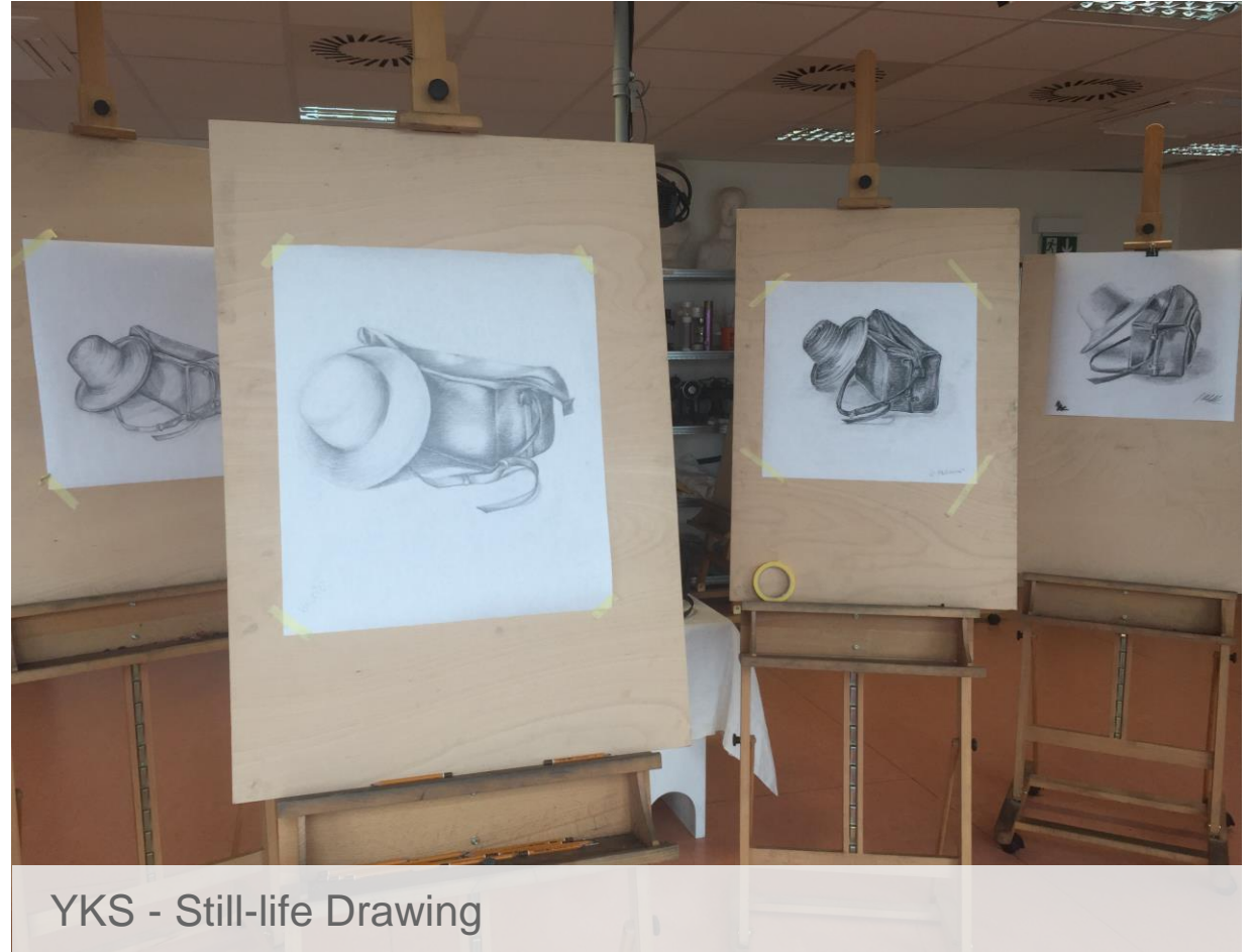
YKS - Still-life Drawing