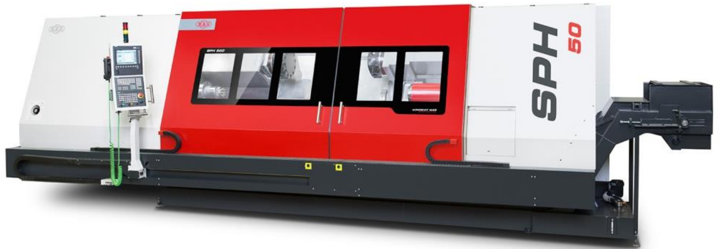
SPH 50